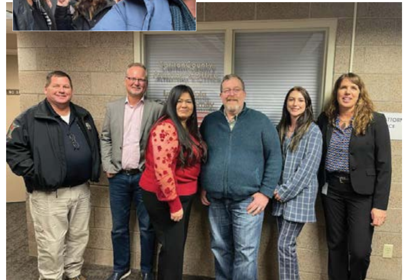
NMCADV and La Casa receive training from the Duluth Intervention Project